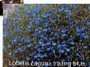
Lobelia Lagopus trailing blue

You can look up plants in the Plant Finder on the Hare Hatch Sheeplands website at: www.harehatchsheeplands.co.uk