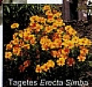
Tagetes Erecta Simba